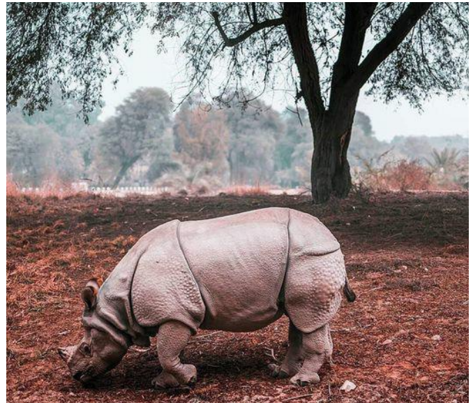
Figure 1: Indian One Horned Rhinoceros at Lal Suhanra National Park, Punjab, Pakistan

The greater one-horned rhinoceros is a unique animal that is mostly found in tall grasses of floodplains, riverine woodlands and rarely found in hills [5] (figure 1). Two rhinoceros that were housed at Laal Suhanra National Park close to Bahawalpur were gifted to Pakistan by the king of Nepal in 1982. These rhinos were housed in an enormous enclosure spanning more than 153,000 acres in Laal Suhanra, Punjab, Pakistan, which is home to this endangered species. Being protected, the park is an essential stronghold for the protection of this endangered species, protecting it from habitat degradation and hunting. The necropsy investigation of the rhinoceros revealed that it had separation anxiety before it died, which was probably caused by the death of its companion from tuberculosis. Since 1982, the two had lived together. According to historical records, the rhinoceros was receiving medical attention for a health issue that began on February 11, 2019. On the morning of February 22, 2019, the animal died despite receiving medical care. An expert team was summoned to examine the animal after it had died.